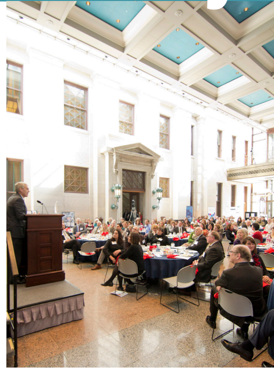
Statehood Day, an annual advocacy event, will take place on March 4, 2015.

Statehood Day is sponsored by Ohio History Connection, Heritage Ohio, the Ohio Archaeological Council, the Ohio Local History Alliance, the Ohio Genealogical Society, the Ohio Historical Records Advisory Board, Preservation Ohio, the Ohio Travel Association, the Ohio Academy of History, the Ohio Council for Social Studies, the Capital Square Review and Advisory Board and the Society of Ohio Archivists. ■