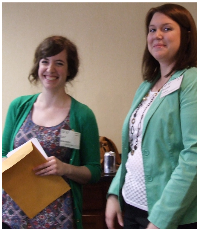
The Alliance's regional meetings kick off March 15. Regional meetings are a great place to connect with friends, learn new skills, and visit new places.

The Region 3 meeting is hosted by the Bedford Historical Society and Museum —while the meeting will be in the 1892 Old Baptist Church, we'll also be welcomed into the rest of their National Register