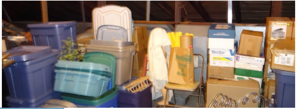
The attic storage space of the Georgian Museum.