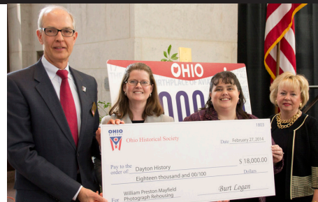
Representatives of Dayton History receive their "big check" at the 2014 Statehood Day. Dayton History attended a History Fund Help webinar and is a member of the Ohio Local History Alliance.

You can find the complete schedule and descriptions for the Museum Educator Series at www.creativelearningfactory.org/programming/webinars-workshops . Webinars, including previously recorded sessions, can be purchased individually, for a group of participants within your institution, or as a full season with a season pass! For the group rate or season pass, email info@creativelearningfactory.org .