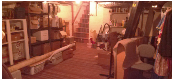
The basement of the Fairfield Heritage Association's Sherman House Museum.

Some storage shortages can be avoided by writing a collections policy. As the FHA team all agreed, "You can't be the com-